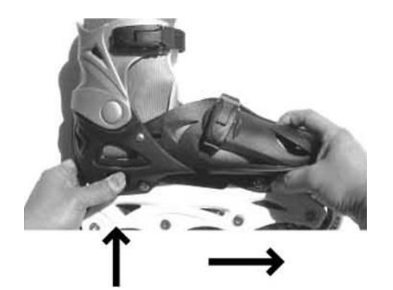
Pull the tip (regulation button)