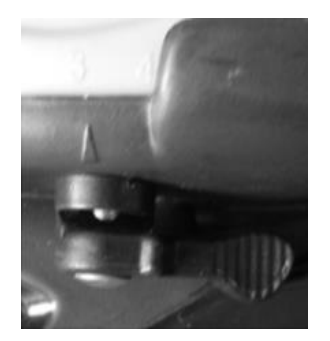
Secure the lever

3. Once the size is adjusted, secure the lever by turning it back by 90° in clockwise direction or release the regulation button.