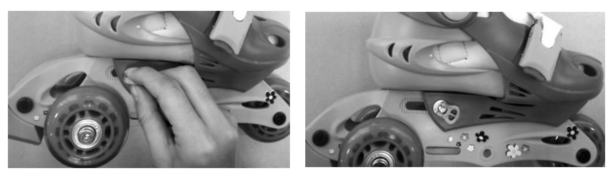
Release the lever

4. Some types of levers are secured differently.