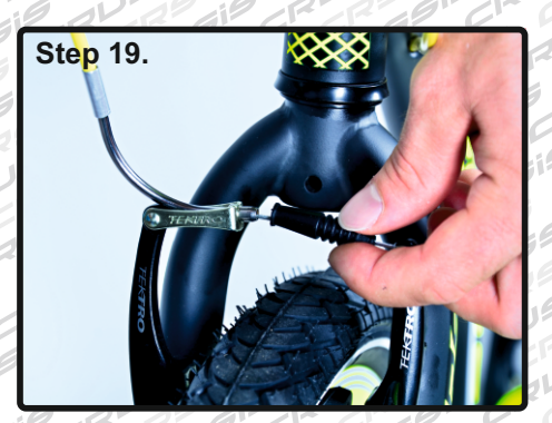
Adjust the boot (gum)