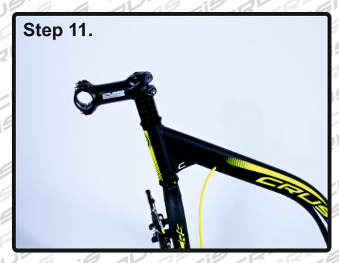
In this step set the direction of the stem Tighten the screws on the stem with force 4 NM