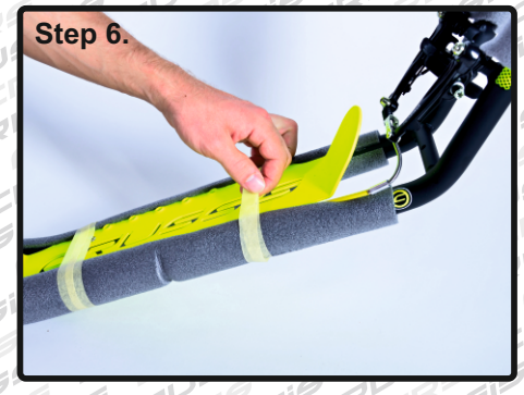
Remove the protecting material from frame