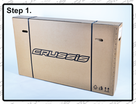
Make sure that cartoon is not damaged