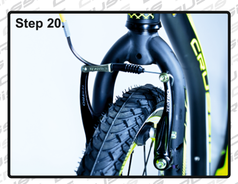
Test the brakes