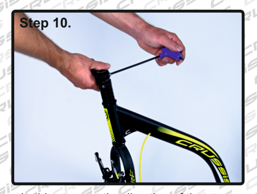
In this step set the direction of the ster roughly. You will align it precisely later with the wheel on