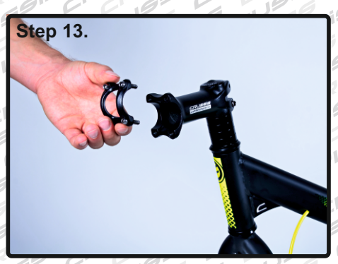
Attach the handlebars