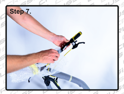
Remove the protecting material from handlebars