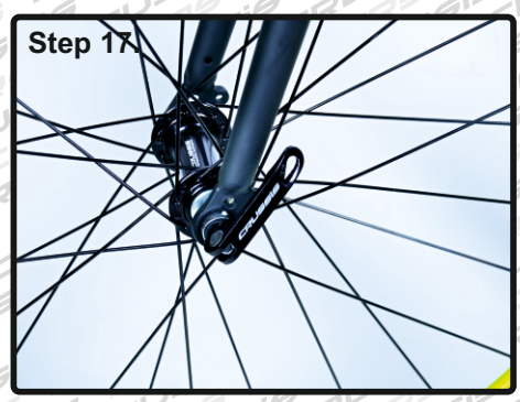
Correct position of the quick release axle to the fork after tightening