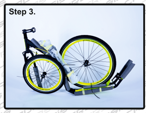
Wheels are attached to the frame