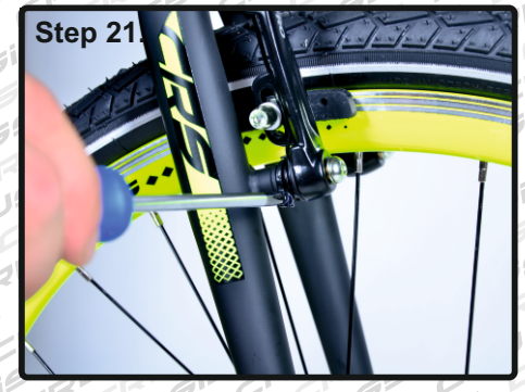
If the brake is rubbing the rim adjust the position of the brake pad. With tightening the screw distance will increase