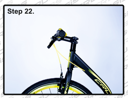
Check the slope of the handlebars so it will suit the angle of the brake levers. We recommend setting at 45 degrees