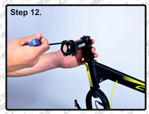
Remove the screws from the front part of the stem