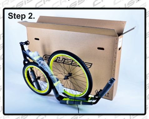
Remove the kick scooter out of the box