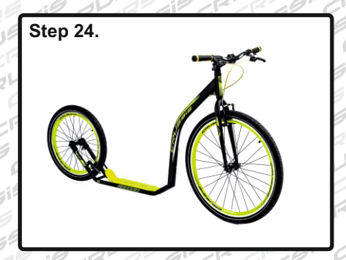
We wish you many happy kilometers on your new kick scooter CRUSSIS!