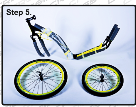
Put wheels aside