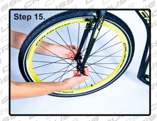
Put wheels back on