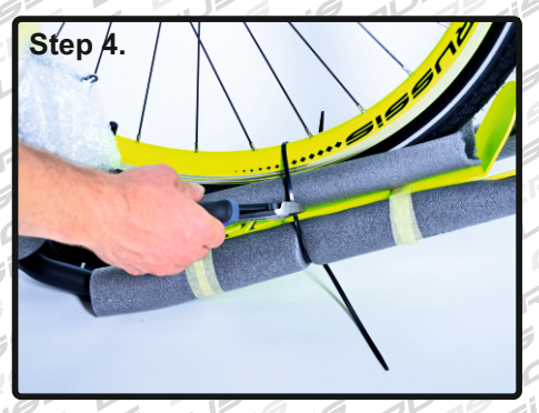
Remove the tape holding front and rear wheel