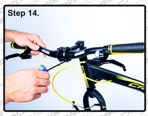
Put back the front part of the stem and lightly tighten, adjust the angle of the handlebar and screw it with 4 NM