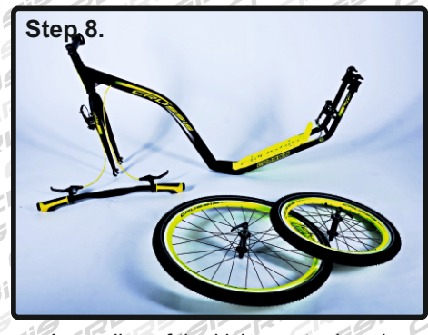
Assemling of the kick scooter is only in attaching wheels and handlebars