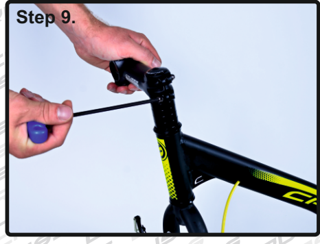
Loosen the screws on the stem and align so that it faces forward while riding