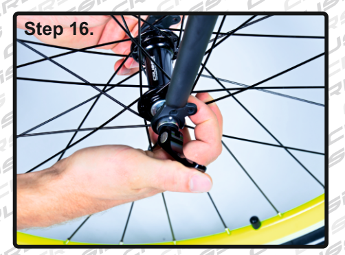
Tighten quick release. Mind the direction of the wheel