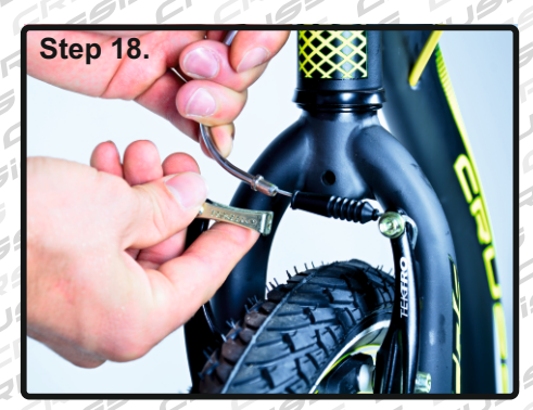
At the front and rear break put cable guard into cable bridge