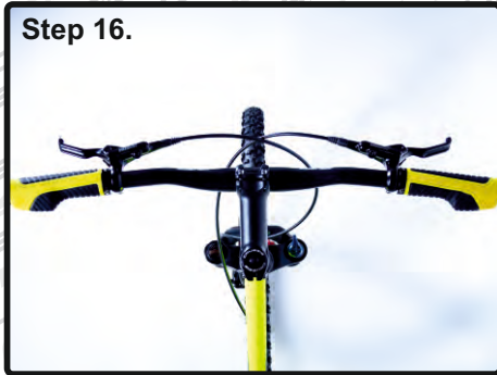
Step 16. Stem and front wheel must form a single axis. Make sure that stem is properly tightened with force 4 NM