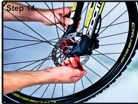
Step 14. Put from wheel back on, tighten quick release. Mind the direction of the wheel