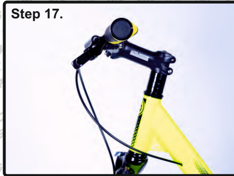
Step 17. Check the slope of the handlebars so it will suit the angle of the brake levers. We recommend setting at 45 degrees