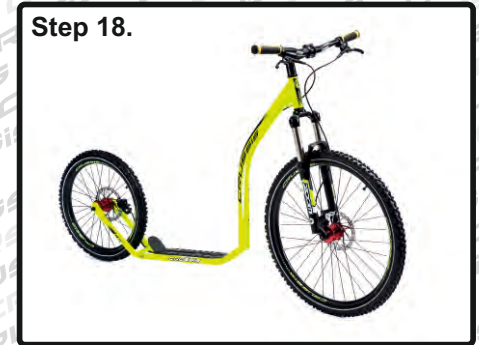
Step 18. We wish you many happy kilometers on your new kick scooter CRUSSI!