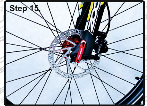
Step 15. Correct position of the quick release axle to the fork after tightening