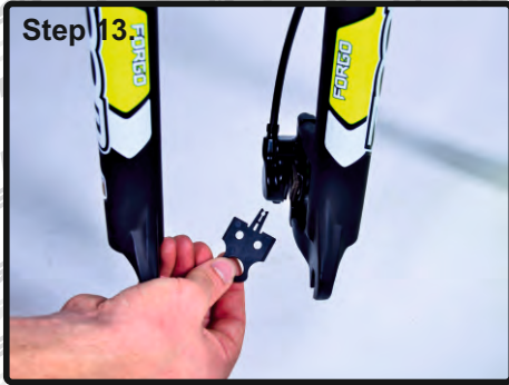
Step 13. Remove the plastic stopper from between the brake pads. ATTENTION! DO NOT PRESS BRAKE LEVER UNTIL YOU PUT THE WHEEL BACK ON!