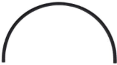
Aluminum hoop, 4x