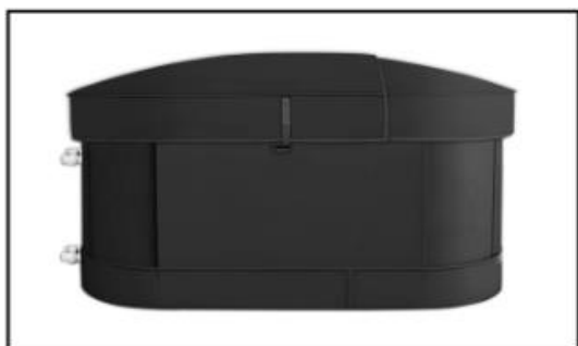
Anti water accumulation

Repeat for all straps. The center laminate bar should be bent more than the bars on the sides. If the laminate bars are bent, this will prevent the lid from getting wet.