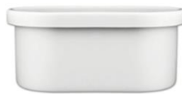
Inner tub, 1x