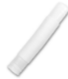
Drain hose, 1x