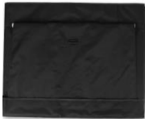
Outer tub, 1x