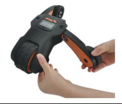
2. Unfold the rear wheels