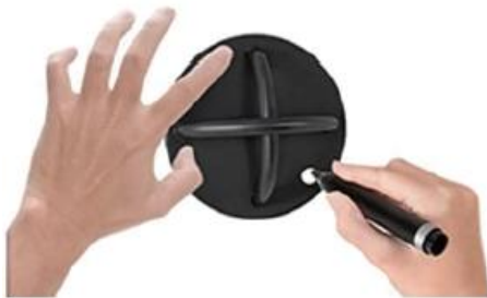
1. Mark the positions