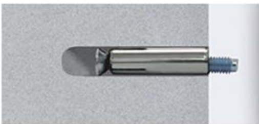
3. Clean the hole and place bolt