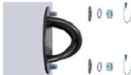
4. Tighten the bolts