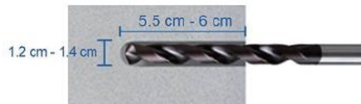
2. Drill a hole in solid ceiling